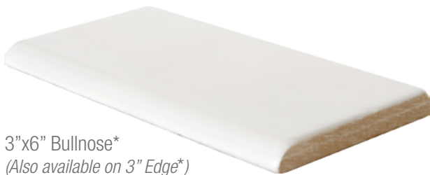
3"x6" Bullnose* (Also available on 3" Edge*)