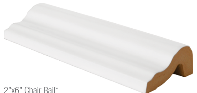
2"x6" Chair Rail*